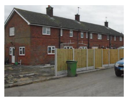
View from the proposed site to properties on the other side of Regents Close

The design of the one and a half storey dwelling is fairly simple, similar to the bungalows within the vicinity, the new dwelling would be completed with the use of Cadeby red multi bricks with Russell Grampian (Slate Grey) roof tiles which are considered acceptable as they would be similar to the materials used on Regents Close.