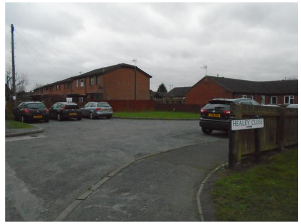
View to the communal car parking with green space

development area. The site does not lie within a conservation area, nor does it lie within the flood zone.