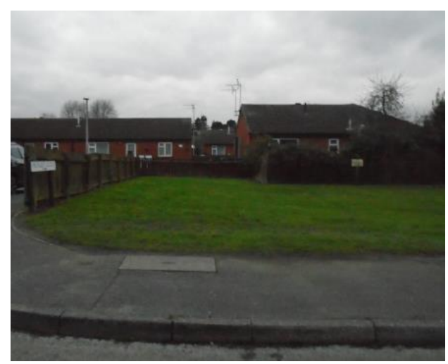
Proposed site layout