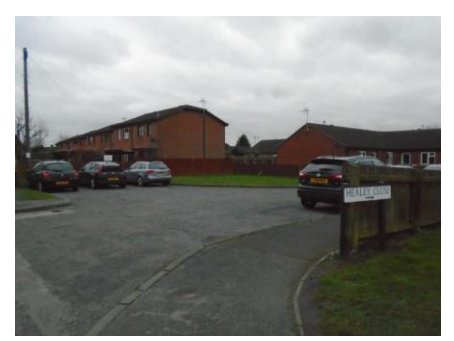
View from the proposed site to Regents Close and Healey Close