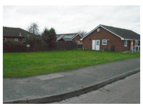
View from the proposed site to the adjacent properties